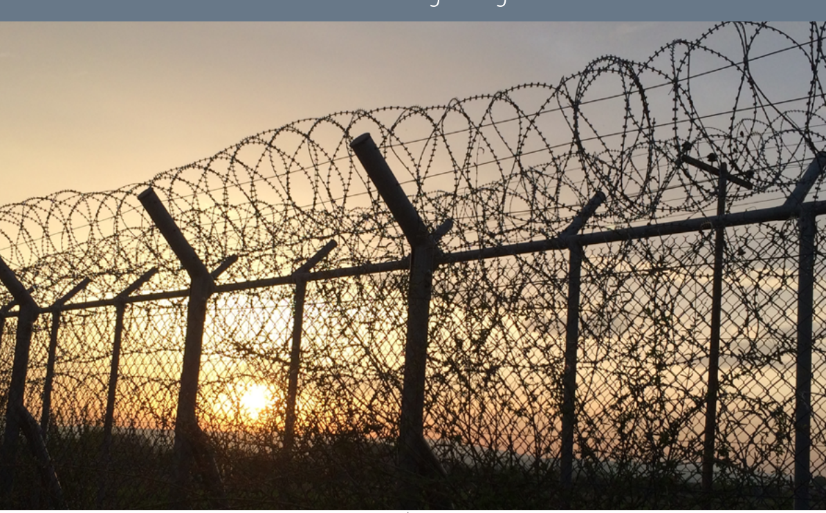
1 January - 31 December 2022

European Committee for the Prevention of Torture and Inhuman or Degrading Treatment or Punishment