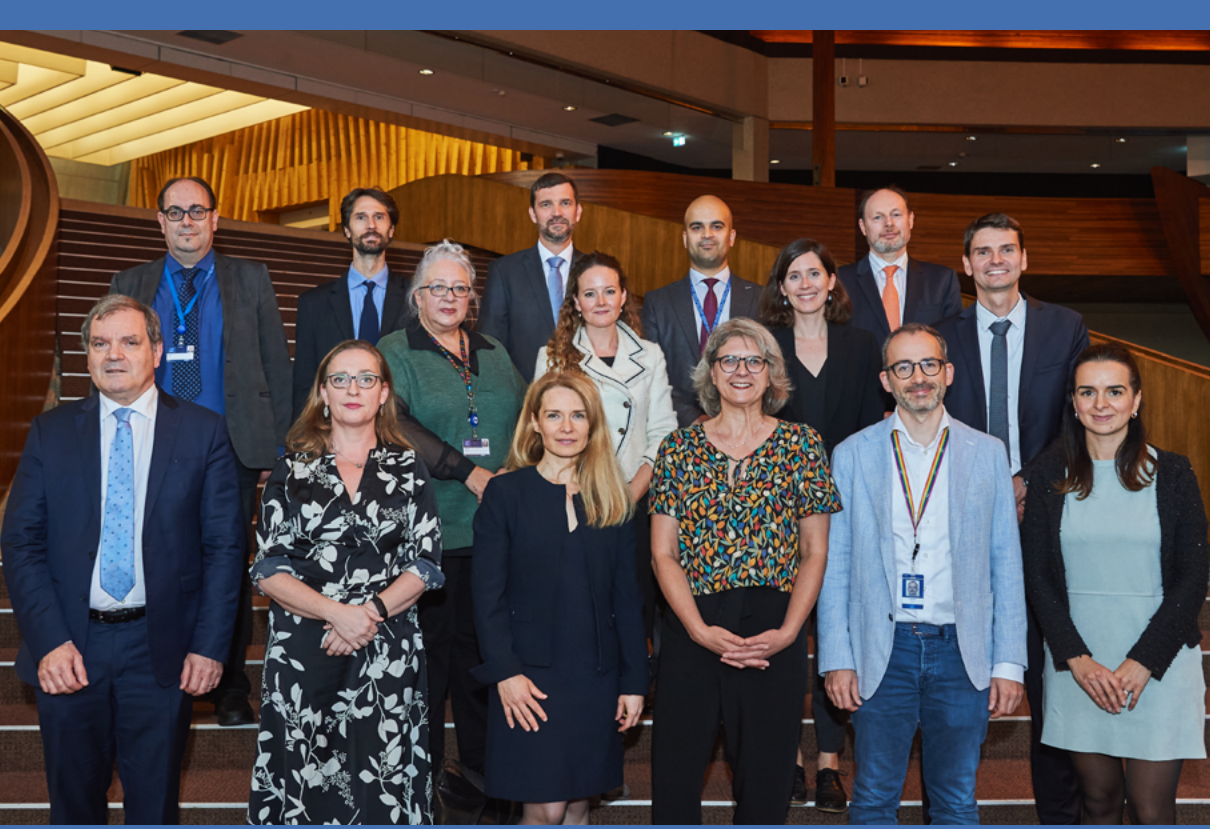
Some members of the CPT secretariat do not appear in this picture.